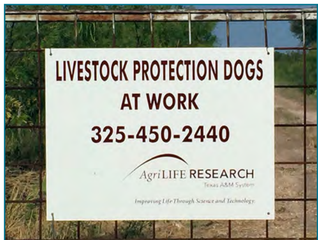
FIGURE 2. Ranchers should use signage that indicates livestock guardian dogs are in the area. This can prevent conflict and provide contact information for people who suspect a problem.

Before you release a guardian dog, tell your neighbors you are adding a dog or dogs to the ranch and what steps you would prefer they take if your dogs are found off the property. It is wise to use dog tags that include contact information and indicate that the dog is a livestock protection animal. Post signs on the ranch boundary with public roads to inform people that guardian dogs are working (Fig. 2).