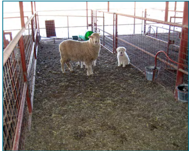
FIGURE 3. This is a bonding pen for young livestock guardian dogs. In this case, a ewe with lambs are being used. It is important to use animals that are accustomed to guardian dogs and include all species of livestock the dog may be required to protect. Do not allow the dog to bite or chew on weak or small animals. The area in the background is blocked off for the guard dog and its feeding station.

The ideal time to begin bonding guardian dogs to livestock is from 4 to 8 weeks of age, while they are still nursing. Research indicates that dogs might not properly bond with livestock if the bonding phase is started after the dog is 16 weeks old.