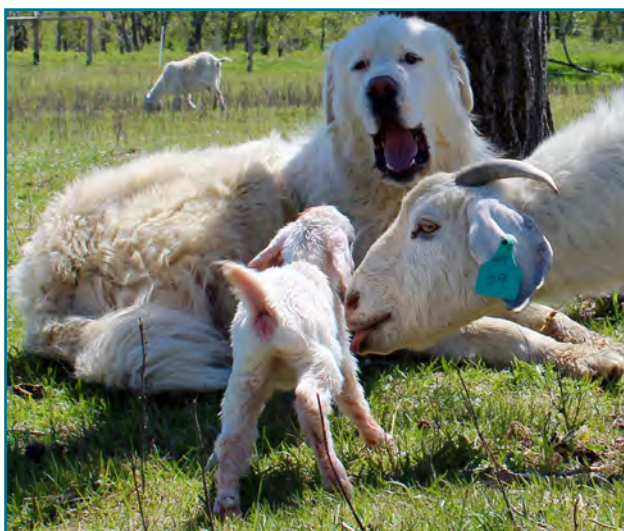
FIGURE 6. Dogs are attracted to animals at parturition and provide added protection when small ruminants are most susceptible to predation.

Health care for LGDs should be planned carefully in consultation with a licensed veterinarian and include scheduled vaccinations, deworming, and heartworm prevention. You should also control external parasites, such as fleas and ticks. Consider rattlesnake vaccines as added protection for LGDs because they are more likely to encounter rattlesnakes than normal pets. Some breeds of guard dogs require grooming to prevent matted coats and heat stress. On occasion, a dog will need help removing porcupine quills. Longevity is one of the most important ways to reduce LGD cost—good health care is essential.