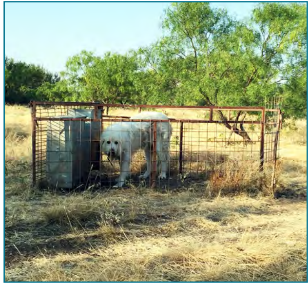
FIGURE 5. This self-feeder is made from three panels arranged as a triangle. The right side of the pen and has a small panel with a 2-foot space at the bottom for dogs to go under.

The number of dogs required for optimal protection varies according to the size of pasture, number of herd groups, topography, flocking instinct of the livestock, number and species of predators, fencing, and guardian dog behavior. The general recommendation is one dog per 100 ewes or does. However, this number is not absolute. Except for small flocks that are close to the house, two dogs are probably more desirable because if one dog is lost the animals will still be protected. On the other hand, flocks of 1,000 or more seldom have more than six LGDs. Start with one or two dogs and evaluate their effectiveness after they reach maturity. Adding newly bonded dogs to a herd that has a mature and effective LGD already in place, is often more successful than starting with three or more untrained dogs. Younger dogs learn from