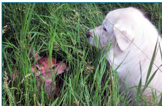
FIGURE 8. This guardian dog found a newborn fawn hidden in tall grass. The guardian dog provided a safe haven for the deer. In other situations, guardian dogs may prey on newborn fawns. How a dog behaves depends on the dog and its environment during the bonding phase.

On many sheep and goat operations, fee hunting for whitetail deer is an important revenue source. Small numbers of guard dogs have been documented to chase, harass, and kill deer. In these instances, the guard dog has identified the deer as a trespasser. If this behavior cannot be corrected, the dog might need to be removed or restrained from specific areas at certain times of the year. On the other hand, dogs that do not interfere with deer and keep predators away provide a safe haven for deer to rear their offspring (Fig. 8). Recent reports indicate that captive deer breeders are using LGDs to decrease predation of fawns.