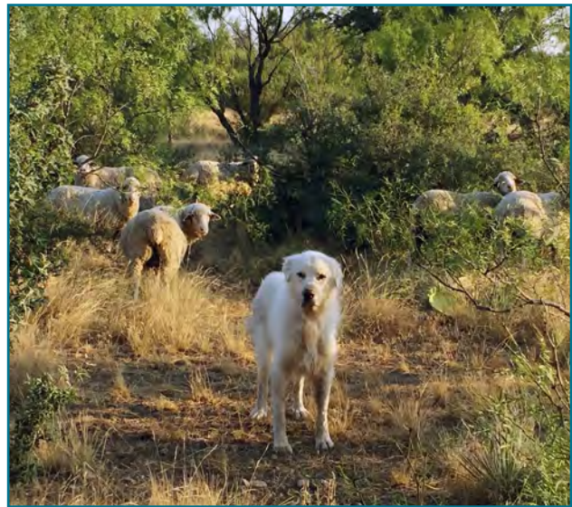
FIGURE 1. Most often, the dominant guardian dogs will investigate disturbances in a pasture and create a buffer space between themselves and their flock/herd.

Some breeders market fully trained or bonded livestock guardian dogs. If you do not have guardian dogs and are suffering heavy predation, this is a good option because trained dogs can begin working immediately. Conversely, it takes 12 to 24 months for puppies to become effective guardians. Trained dogs are more expensive but they are often worth the investment. This is especially true if the breeder offers money back or full replacement guarantees. The risks with purchasing a trained LGD include their running away or failure to bond with